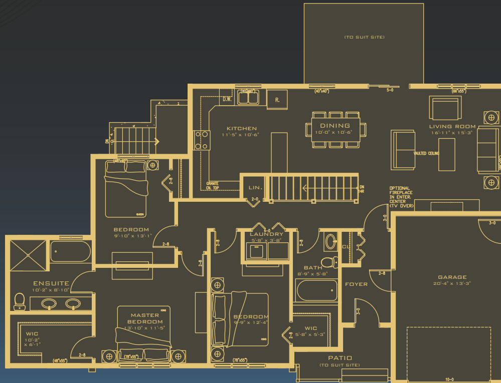
Main Floor 1,552 sq.ft.